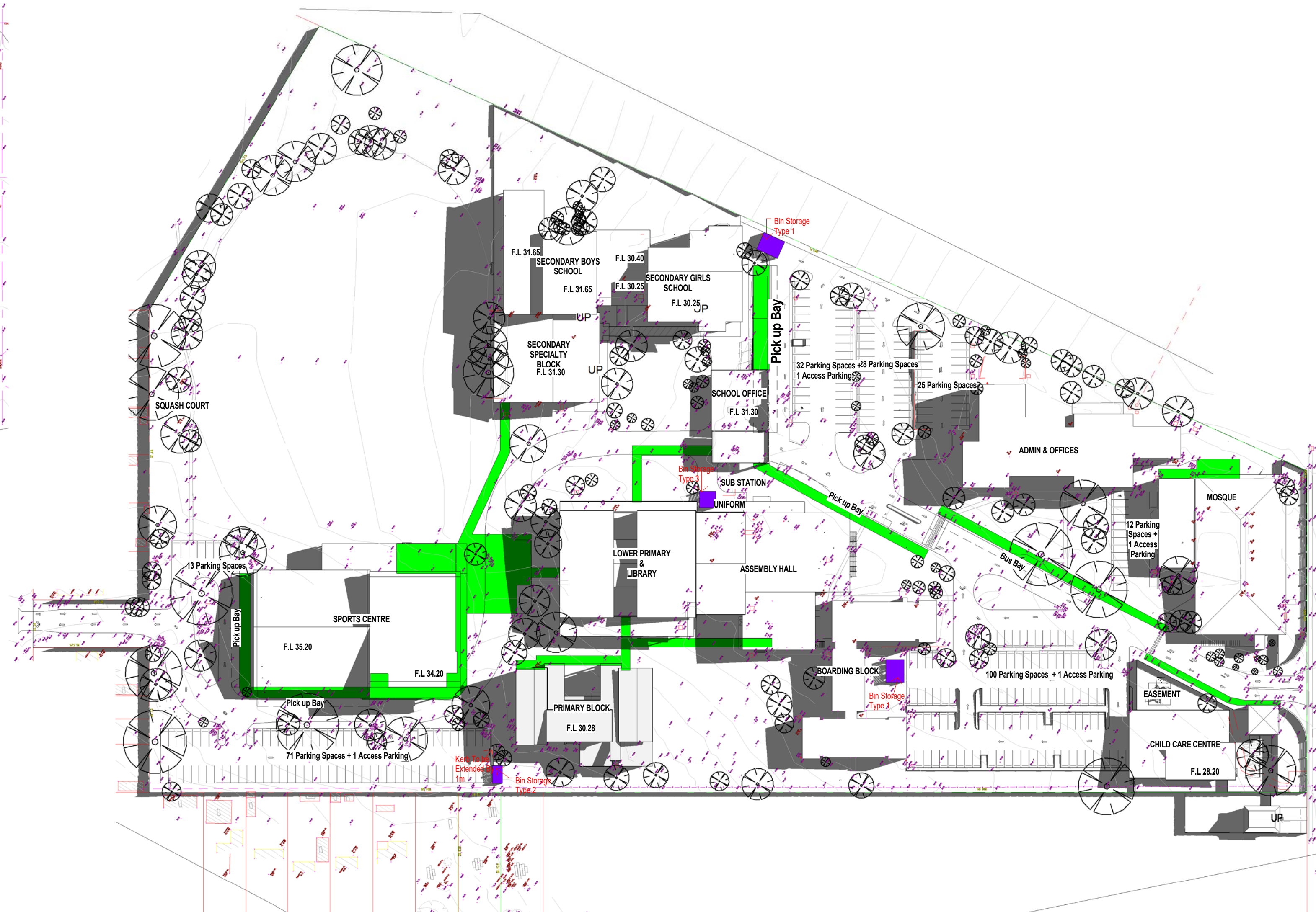
2 Proposed - Shadow Diagram March 21 - 8am 1 : 1000